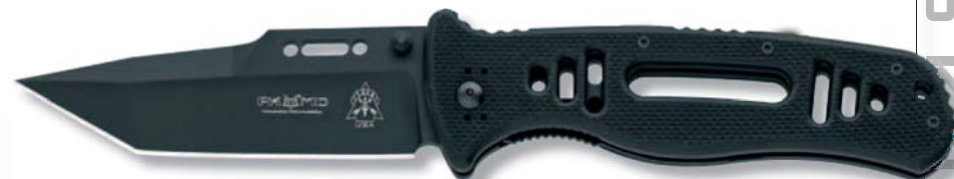
Art. FX-CQT-711 Tops Knives TANTO Liner Lock

lama cm 9,5 - blade 3.74" ◦ totale cm 22 - overall 8.66" spessore mm 3 - thickness 0.118" ◦ peso 115 g - weight 4.05 oz manico - handle → G10 clip → reversibile acciaio inossidabile - reversible stainless steel