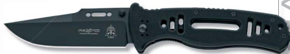
Art. FX-CQT-747 Tops Knives CLIP Point Liner Lock

lama cm 11 - blade 4.33" ◦ totale cm 25,8 - overall 10.15" spessore mm 4 - thickness 0.157" ◦ peso 270 g - weight 9.52 oz manico - handle → G10 clip → reversibile acciaio inossidabile - reversible stainless steel