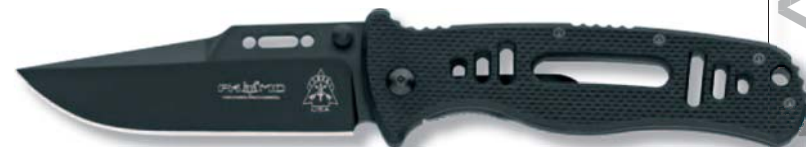
Art. FX-CQT-22CP Tops Knives CLIP Point Frame Lock

lama cm 9,5 - blade 3.74" ◦ totale cm 22 - overall 8.66" spessore mm 3 - thickness 0.118" ◦ peso 115 g - weight 4.05 oz manico - handle → G10 clip → reversibile acciaio inossidabile - reversible stainless steel