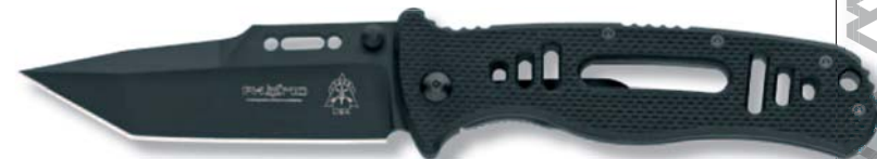
Art. FX-CQT-22T Tops Knives TANTO Frame Lock

lama - blade → acciaio inossidabile - stainless steel → N690Co durezza - hardness → HRC 58-60 trattamento - coating → DLC