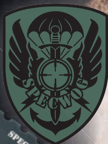
Art. FX-0171113 Specwog Warrior Knife

lama cm 11,5 - blade 4.52" totale cm 25,5 - overall 10.03" spessore mm 6 - thickness 0.23" peso 335 g - weight 11.81 oz manico - handle → G10 fodero - sheath → KYDEX con sistema MOLLE KYDEX with MOLLE clips