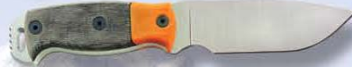
RD-6 Signature Series with black/orange handle-9440BO 11.887" overall, 6" blade