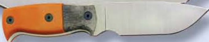
RD-6 Afghan Signature Series with orange/black handle-9441OB 9.878" overall, 4.438" blade

These knives feature S7 steel, .375 blade thickness and satin finish blades. Black nylon sheath with Kydex ® insert is included.