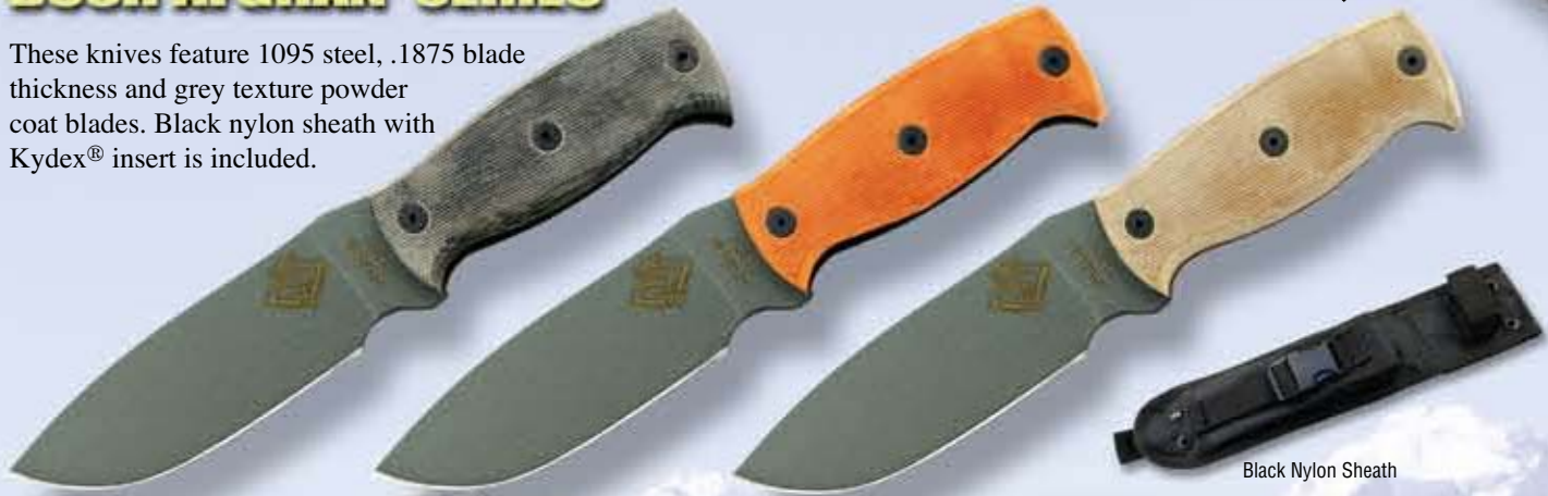
RBS Afghan Black Micarta Handle-9447BM

These knives feature 1095 steel, .1875 blade thickness and grey texture powder coat blades. Black nylon sheath with Kydex® insert is included.