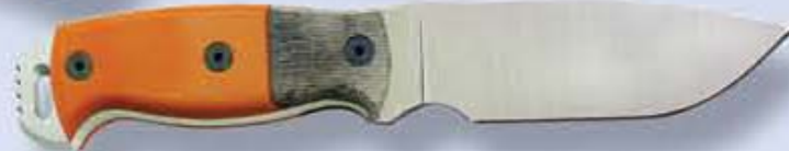
RD-6 Signature Series with orange/black handle-9440OB 11.887" overall, 6" blade