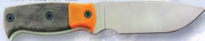
RD-6 Afghan Signature Series with black/orange handle-9441BO 9.878" overall, 4.438" blade